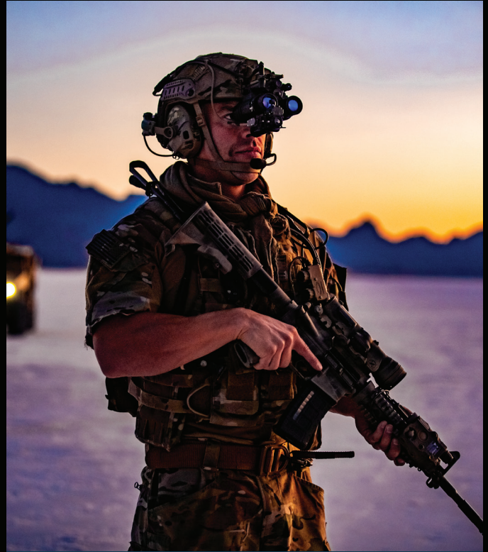
The Enhanced Night Vision Goggle-Binocular (ENVG-B) provides the U.S. Army's close combat forces with capability to observe and maneuver in all weather conditions, through obscurants, limited visibility, and under all lighting conditions. This system signifies an evolution in technology that stems from innovative and collaborative efforts and successfully demonstrates rapid prototyping process that help meet the Army's modernization priorities.

More capabilities must go into fewer systems while decreasing that systems SWaP from its less capable, legacy equivalent. Weapons sights should work day and night, and should also provide range and angle to targets while displaying Red and Blue Forces in the field of view. Targeting systems should provide multi-spectral image fusion, not just day color and thermal imagery. They must be able to generate precise target coordinates in contested environments, and they must work seamlessly across the network to inform the Forward Observer and provide actionable data up stream. Given all of these necessary capabilities the burden on soldiers is real and can only be mitigated through smart, innovative system architectures that prioritize the soldier as a system of systems and treat human factors as a KPP.