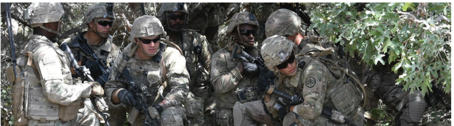
Supporting the warfighter with the latest in technology to make each warrior more effective, efficient and capable is the goal of Army Futures Command.

So the future foot soldier will be surrounded by robotics, from the exoskeletons they wear to the drones they send to scout ahead, all linked by invisible wireless networks. That's a far cry from their grandfathers slogging into battle with a rifle, a helmet, and a prayer. But despite all the technological advances, for the foreseeable future, the essential, central element remains human ingenuity and courage.