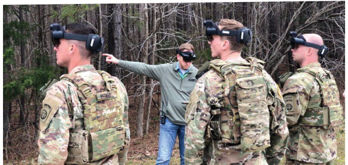
Soldiers train with the IVAS augmented-reality headset at Fort Pickett.

The new rifles will all have attachment rails, electrical power, and digital links to accept a wide and ever-growing range of electronic accessories. Arguably the most important is the Family of Weapon Sights - Individual. Known as FWS-I, the smart gunsight wirelessly transmits targeting data from the rifle to the latest night vision goggles (Enhanced Night Vision Goggle - Binocular, or ENVGB) or, in the near future, to the IVAS so the soldier sees a cross-hairs that indicates exactly what would be hit if the trigger was pulled at that moment. In testing, the gunsight not only improved accuracy, but it saved precious seconds of reaction time, since the soldier no longer had to bring the rifle up to the shoulder and squint through the sights to fire precisely.