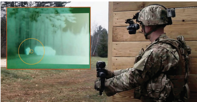
The inset image shows what the soldier can see through the wirelessly linked ENVG-III goggle and FWS-I gunsight.

The foundation of this network is a new Adaptive Squad Architecture (ASA) that prescribes how all the different electronics soldiers wear or carry into battle have to connect to one another. But that squad-level mesh must connect to the battlefield-wide Integrated Tactical Network the Army is now developing to field to combat brigades. The tactical network, in turn, needs to connect back to the global defense department networks and ultimately to massive servers in the United States, which will house the big data needed to fuel artificial intelligence.