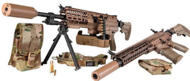
Sig Sauer's prototype Next Generation Squad Weapons.

That's not to say the rifle itself will be low-tech. To the contrary, the revolution begins with the bullet. Informed by long-range firefights in the Afghan mountains, where guerrilla fighters increasingly wear body armor, the Army wanted an infantry weapon with much more range and penetrating power than the current 5.56 mm round, so they picked the 6.8 mm.